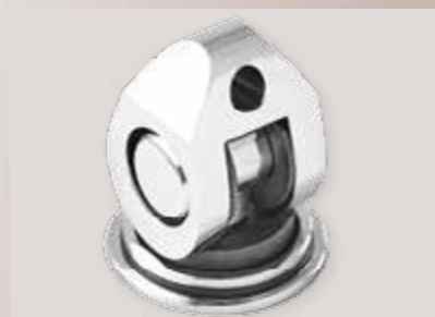
SMALL QUICK-LOCK SYSTEM