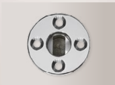
HIGH-POLISHED STAINLESS STEEL DECK FITTING